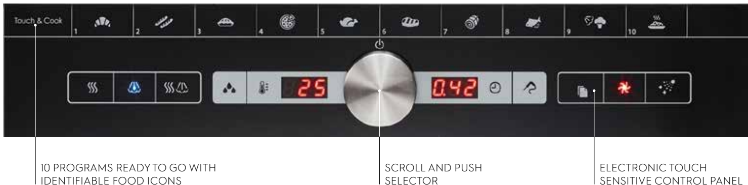
10 PROGRAMS READY TO GO WITH IDENTIFIABLE FOOD ICONS